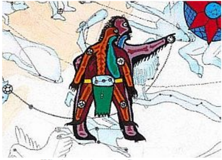
Wisakaychak on the Cree star map © Native Skywatchers