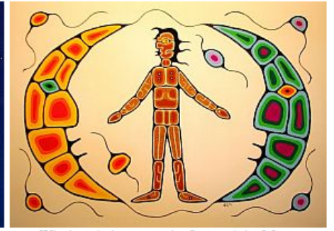
Wisakaychak creates the Sun and the Moon

http://judy-volker.com/StarLore/Myths/Native American North America2.html